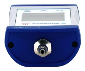
ECO 240-2 front

Thanks to the optional calibration certificates, the baro-/vacuum-meter can serve as a perfect reference device for checking the actual accuracy of corresponding devices.