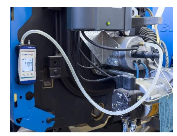
Field application with ECO 210 manometer

Very robust rubber protective cover for tough field use!