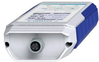
PRO D01 - 1 input, M12 sensor connectors