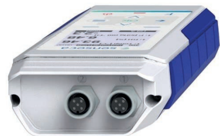
PRO D05.2 - 2 inputs, M12 sensor connectors