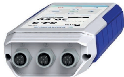
PRO D05.3 - 3 inputs, M12 sensor connectors